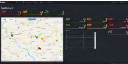
Vehicle Location Overview