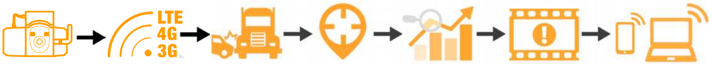
Fleet Overview Dashboard