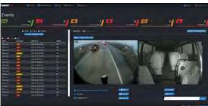
HD Video/Audio Playback