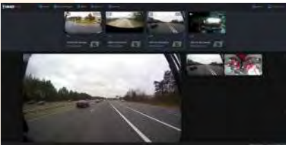
Driver Behavior Reports