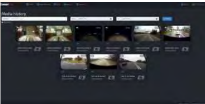
Video Events/Alerts Dashboard